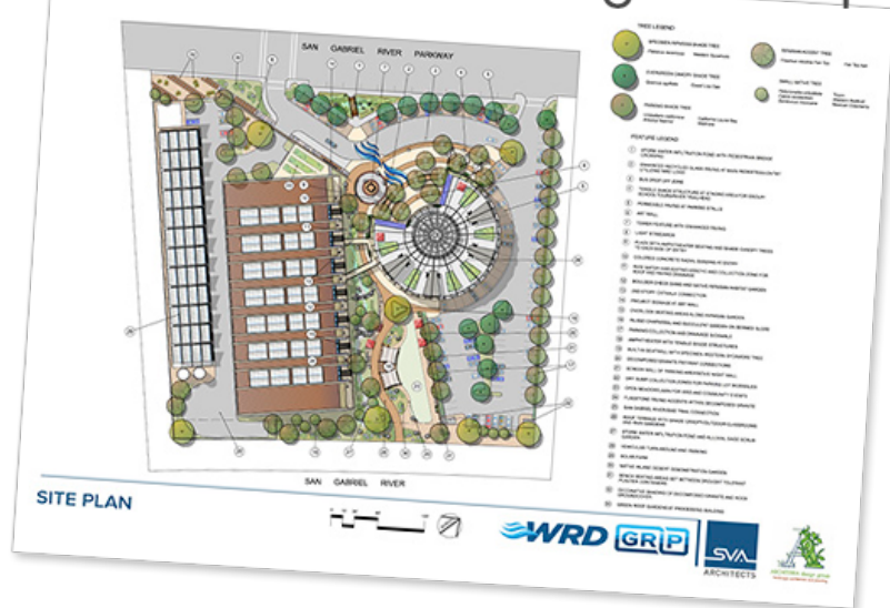
Winning site plan utilized for presentation the Water Replenishment District.